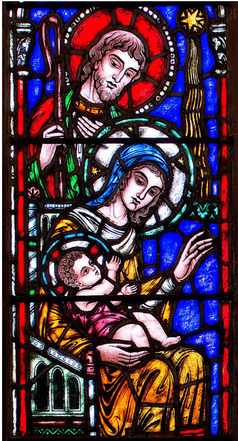
Westminster Presbyterian Church Albany, New York